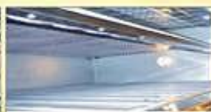
上火加輻射板，加熱均勻 Radiative perforate plate on up frame provides an optional distribution & uniform transfer of the heat to the products.

依產品需求，可選爐膛高度180mm或220mm，也可依產能需求，逐層相疊，或下層加發酵室。 Crown height can be 180mm or 220mm as your request. Underbuilt prover is also available. Modular design, each deck can be overlapped flexible.