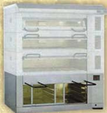
上下火獨立控制外，並加前火比例快速加熱，達到最佳烘焙效果 Up & bottom temperature are controlled separately, plus rapid ceramic heat element on front zone ensure the best baking result.