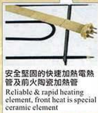
安全堅固的快速加熱電熱管及前火陶瓷加熱管 Reliable & rapid heating element, front heat is special ceramic element