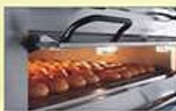
上掀嵌入式爐門，安全易操作 When the door is opened, it slides up into the oven chamber, safety & easy operation