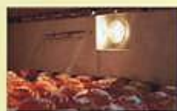
鹵素燈照明 Halogen light in each deck