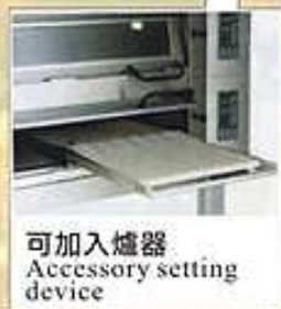
可加入爐器 Accessory setting device